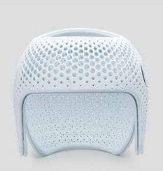
Data Courtesy of Invent Medical