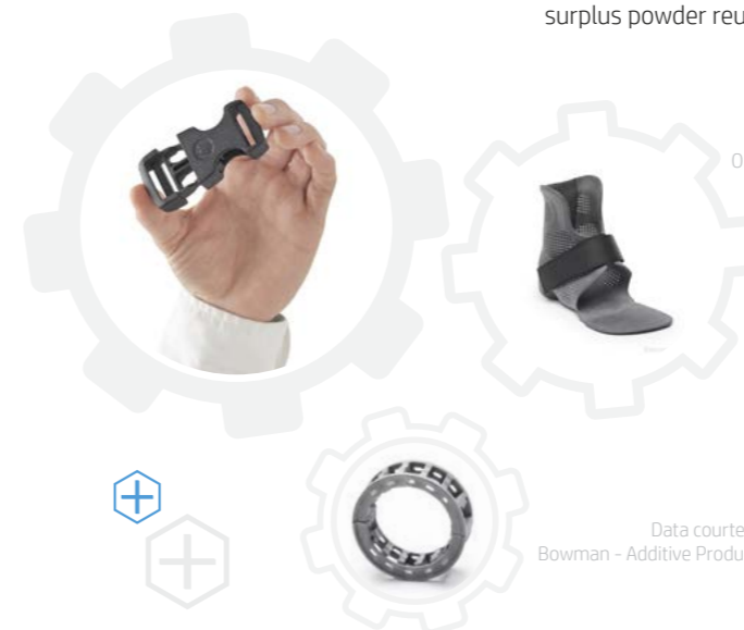
Data courtesy of OT4 Orthopädietechnik GmbH