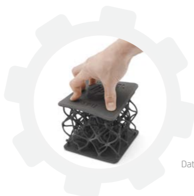
Data courtesy of HP - Lubrizol

An ideal fit for both prototyping and manufacturing scale-up applications, delivering high energy rebound, high-impact absorption, a good abrasion resistance rate, and high elasticity, combined with excellent unpacking/de-powdering properties.