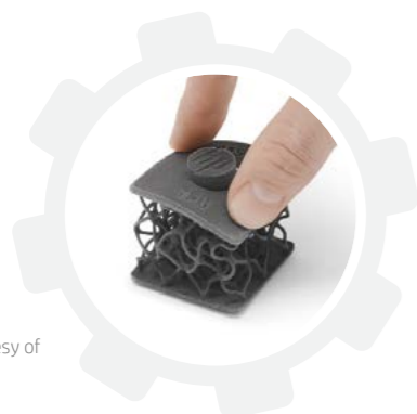
Data courtesy of HP - BASF

Produce flexible TPU parts, with a high throughput, excellent quality and level of detail, and suitable for a wide range of applications. Ideal for parts requiring shock absorption, energy return, and flexibility.